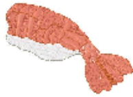
Amaebi (Raw Shrimp) 1.79" x 1.24", 4,850 stitches 3.04" X 2.12", 10,348 stitches 3.88" X 2.70", 15,013 stitches